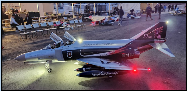
Tim Cardin Attends Winter Warbirds—More Pics and Details Page 3