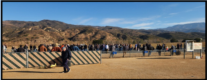
OCMA Safety Meeting—Huge Turnout! - February Make-Up day for those still needing their Badge, Sticker, And/or Key is this weekend Feb 16. Same day as our Squadron Flying Day!

OCMA PARTICIPATING CLUB FOUNDERS/SUPPORTS US SCALE MASTERS AMA CHARTER CLUB 1520