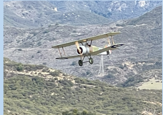
Squadron Flying Day—Jaime proving camo