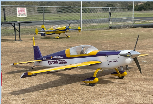
Tim Cardin's "new to him" Extra features a DA100 and looks to be an awesome flyer